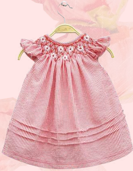
RED SMOCKED DRESS FOR SUMMER $12-$19

Crafted by skilled artisans, each dress features delicate hand-smocking, creating beautiful gathers and pleats that add a touch of elegance and sophistication.