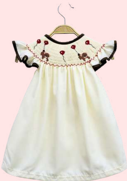
CUTE BEIGE SMOCKED DRESS $12-$19