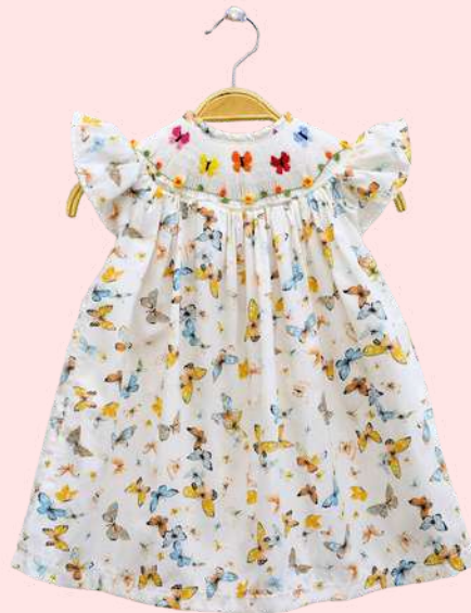
BUTTERFLY SMOCKED DRESS $12-$19