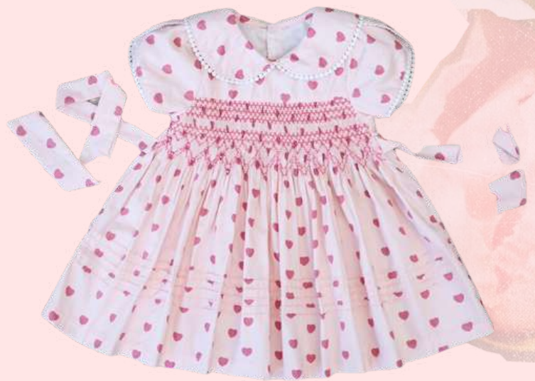
PINK HEART PATTERN SLEEVELESS SMOCKED DRESS