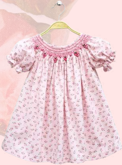
PASTEL PINK SMOCKED DRESS $12-$19

In a world of fast-paced fashion, the children's hand-smocked dress stands as a reminder of the value of traditional craftsmanship and the beauty of timeless design.