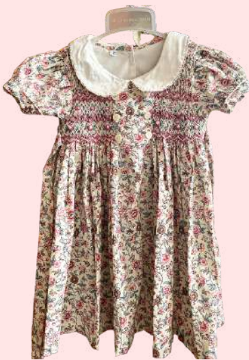
SMOCKED DRESS WITH PINK FLORA PRINTS $12-$19

A hand-smocked dress is a timeless and exquisite garment that showcases the artistry of skilled artisans. Meticulously crafted with delicate hand-smocking, it creates a unique and elegant fabric texture.