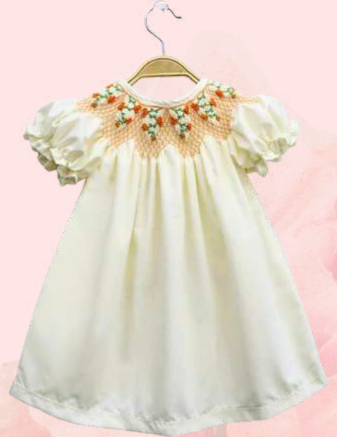
BEIGE SIMPLE PATTERN DRESS $12-$19