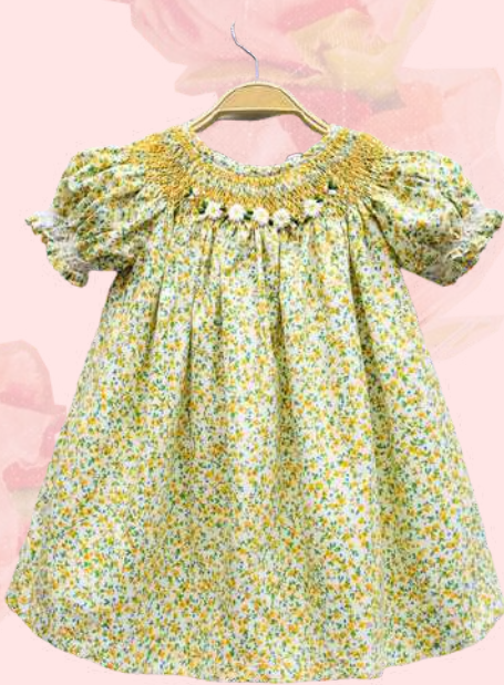
BABY FLOWER PATTERN SMOCKED DRESS

The dress becomes more than just clothing; it becomes a cherished keepsake, embodying the love and care that goes into creating beautiful moments and treasured memories.