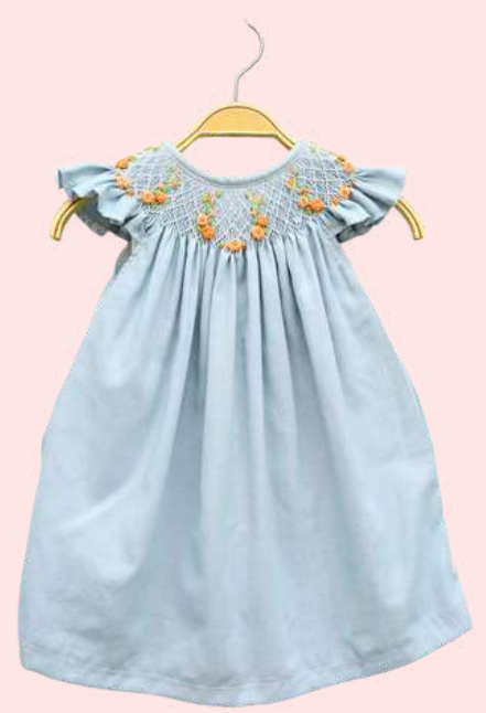
COOL SKY BLUE SMOCKED DRESS $12-$19