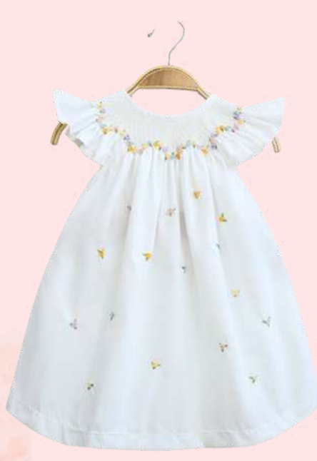
WHITE DRESS WITH EMBROIDERED FLO RA $12-$19