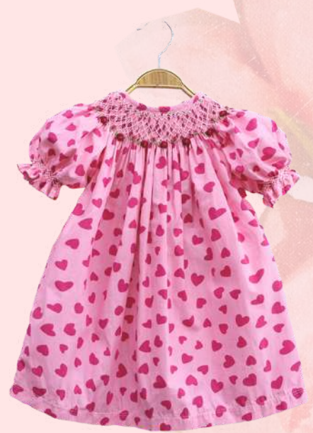
PINK HEART PATTERN SMOCKED DRESS