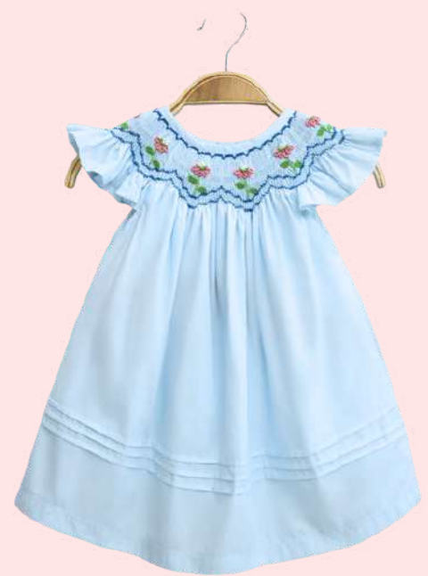
BLUE DRESS WITH HAND EMBROIDERED ROSES $12-$19