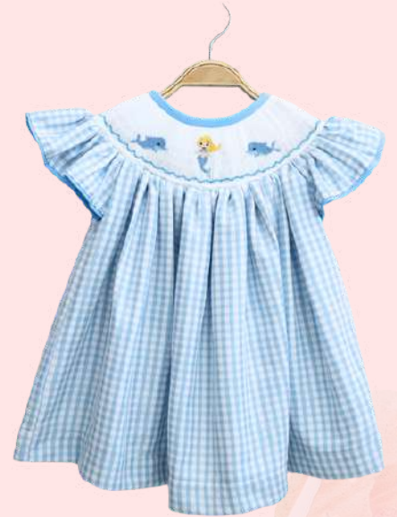
BLUE DRESS WITH WHALE MOTIFS $12-$19