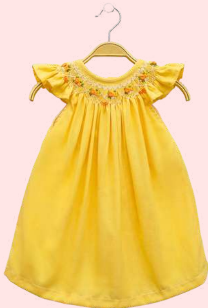
ROSE GOLD SMOCKED DRESS $12-$19