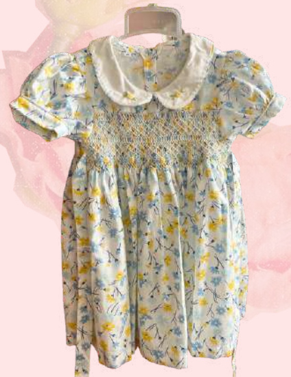
BABY SMOCKED DRESS WITH FLORA PRINTS $12-$19