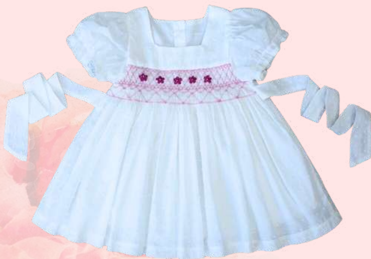
BABY FLOWER PATTERN SLEEVELESS SMOCKED DRESS