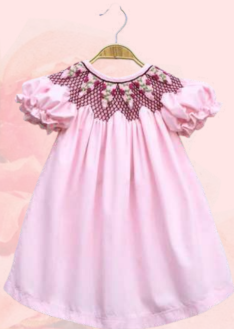
LIGHT PINK FLOWER SMOCKED DRESS $12-$19