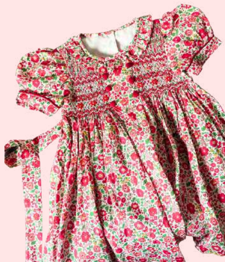
SMOCKED DRESS WITH RED FLORA PRINTS $12-$19