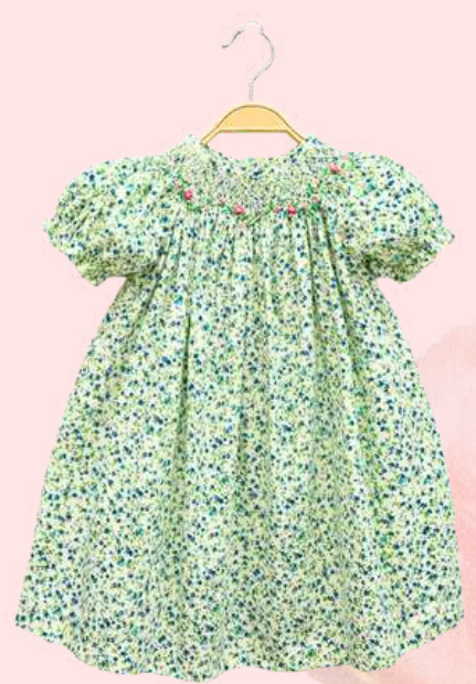
BABY GREEB FLOWER SMOCKED DRESS