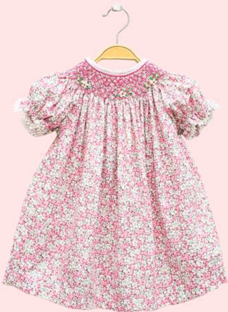
PINK FLOWER PATTERN SMOCKED DRESS