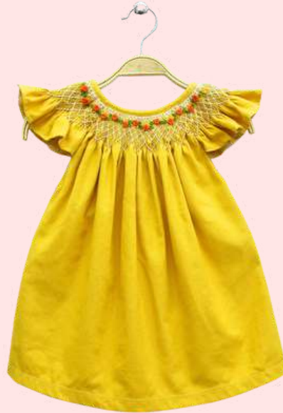
ROSE GOLD SMOCKED DRESS $12-$19