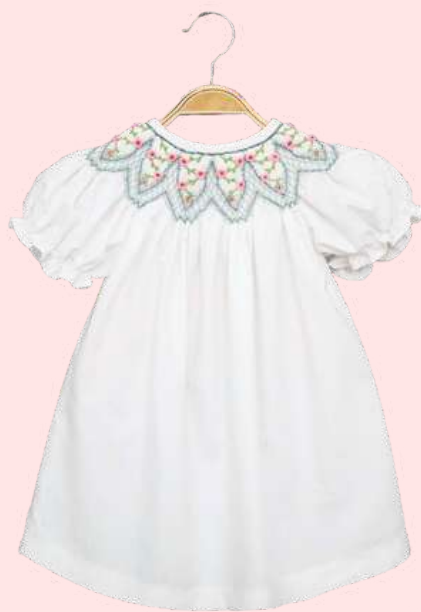
ELEGANT WHITE SMOCKED DRESS $12-$19