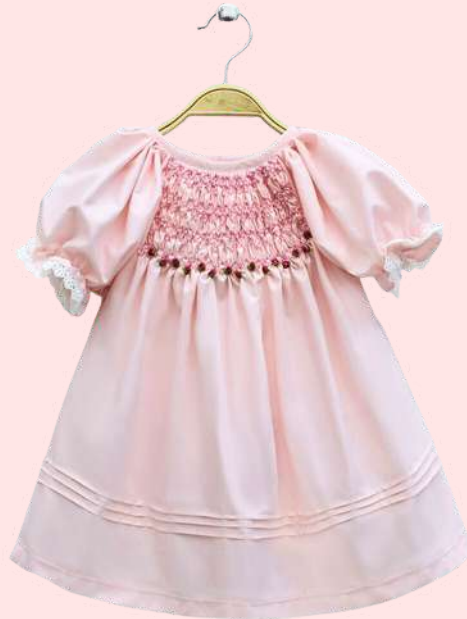
PRINCESS PASTEL PINK SMOCKED DRESS