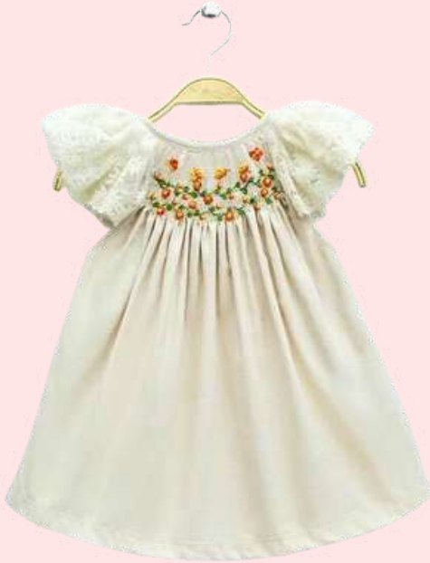
BEIGE FLOWER PATTERN SMOCKED DRESS $12-$19

Its gentle construction ensures a comfortable fit, allowing children to look and feel their best while embracing their inner elegance.