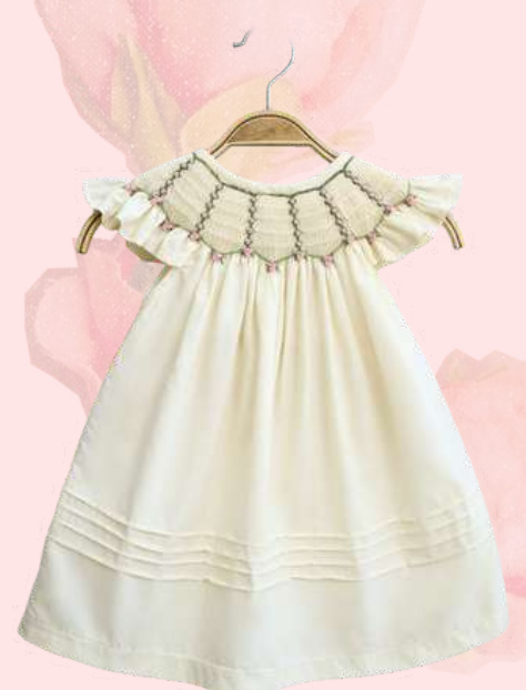
BEIGE PINK SMOCKED DRESS $12-$19