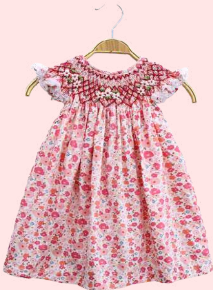
PINK SMOCKED DRESS WITH FLOWER MOTIFS $12-$19