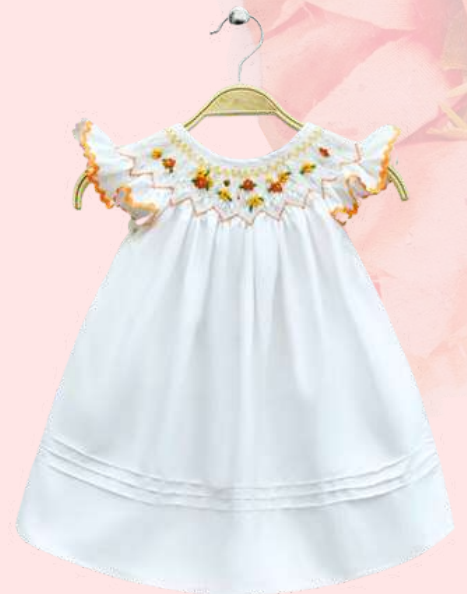
ELEGANT WHITE SMOCKED DRESS $12-$19