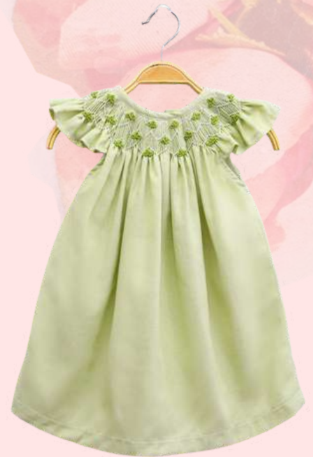
PASTEL GREEN SMOCKED DRESS $12-$19