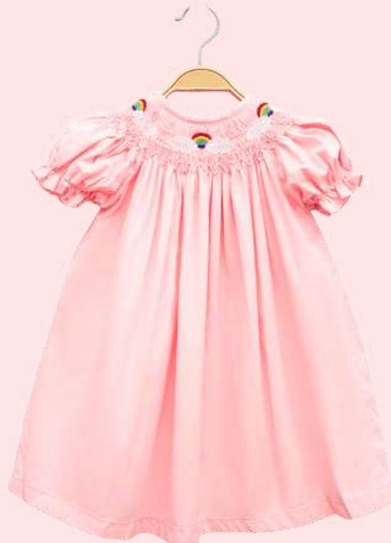
PRINCESS LIGHT PINK SMOCKED DRESS