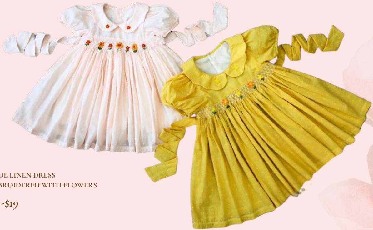
COOL LINEN DRESS EMBROIDERED WITH FLOWERS

With its comfortable fit and enchanting appeal, the children's hand-smocked dress is sure to make little ones feel like royalty while capturing the hearts of all who behold them.