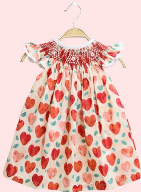
SIMPLE SMOCK DRESS WITH HEART MOTIFS $12-$19