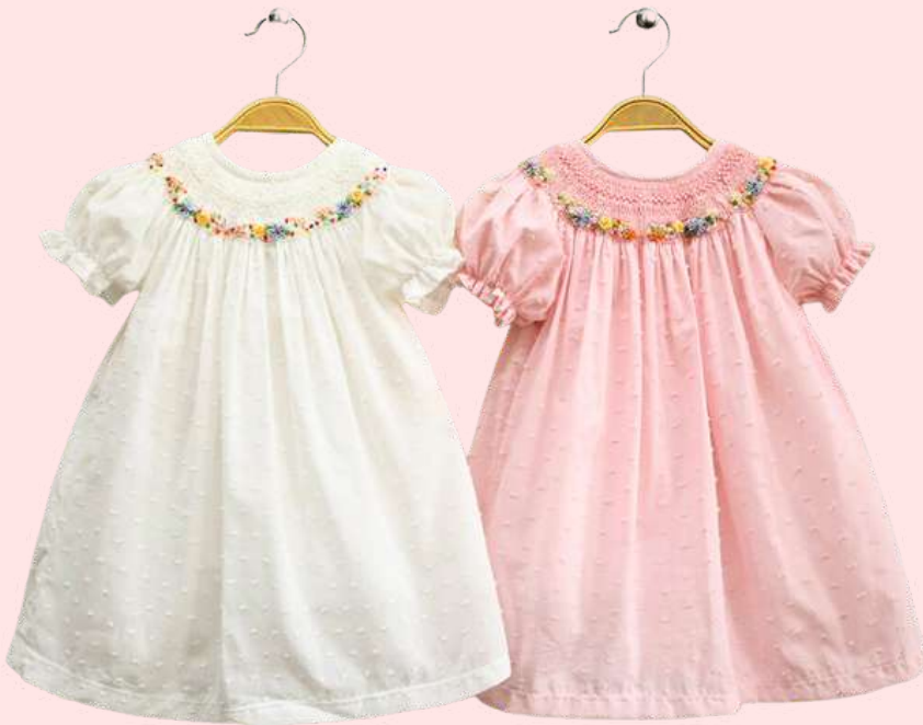
COOL SMOCKED DRESS FOR GIRLS $12-$19